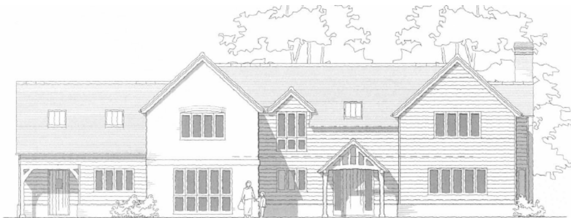
E A S T

MILLFIELD BUNGALOW, FRIENDLESS LANE, FLAMSTEAD, ST ALBANS, AL3 8DE